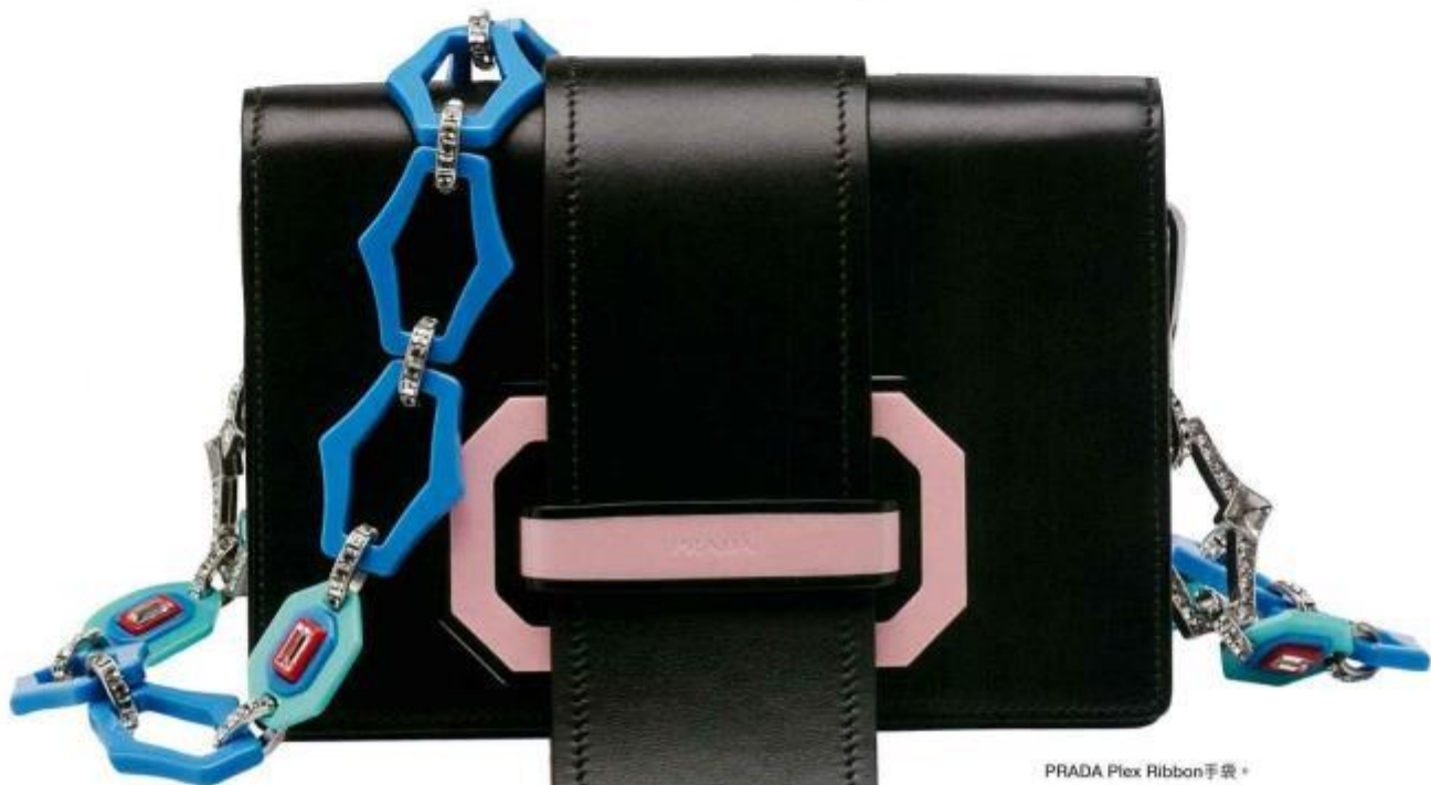
PRADA Plex Ribbon手袋。

所謂的「IT Bag」，除了是代表最新、當下時刻之外，我覺得獨特性才是真正IT bag應有的精髓所在。所謂的獨特性，外觀當然是第一，但創作意念與execution才是重點。聽起來不關消費者事，然而如果背後沒有一班設計團隊日以繼夜絞盡腦汁的埋首苦幹，即使你腰纏萬貫也買不到獨特又夠漂亮的設計。大品牌手袋索價高有它的原因在。來臨中的春夏季，我特別欣賞幾款手袋。Prada全新推出的「Ribbon Bag」是其一。根據同一個基調，共四個款式，分別是Plex Ribbon、Metal Ribbon、Jewels Ribbon及Bowling Ribbon。